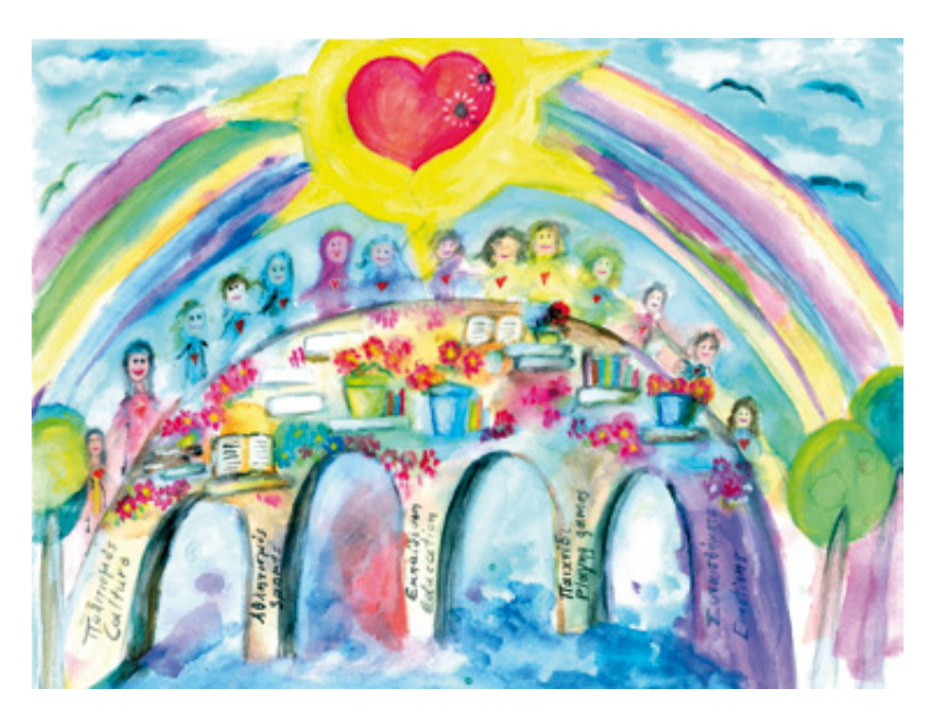
Cover page : Drawing 'School is a bridge which unites all' created by Roma and non-Roma pupils from the 'Eidiko Dimotiko Sxoleio Kofon-Varukoon Panoramatos', Thessaloniki, Greece, 1<sup>st</sup> prize winner in the school drawing competition of the European Commission campaign 'For Roma With Roma': http://ec.europa.eu/justice/newsroom/discrimination/events/151218_en.htm

Communication from the Commission to the European Parliament, the Council, the European Economic and Social Committee and the Committee of the Regions