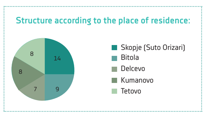
Appendix 6: Structure of the participants in the focus-groups with Roma-returnees Total number of participants: 46

Do you have any suggestions for improving your situation following your return to Macedonia? Would you like to share something we haven't talked about?